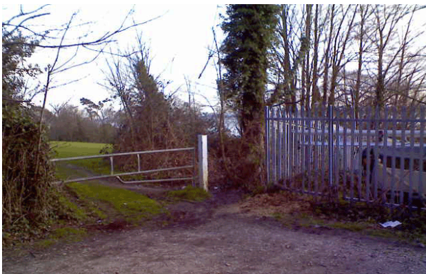
Entrance to visitors rigging / camping area.

All open meeting visitors please proceed straight to the visitor's field (center).