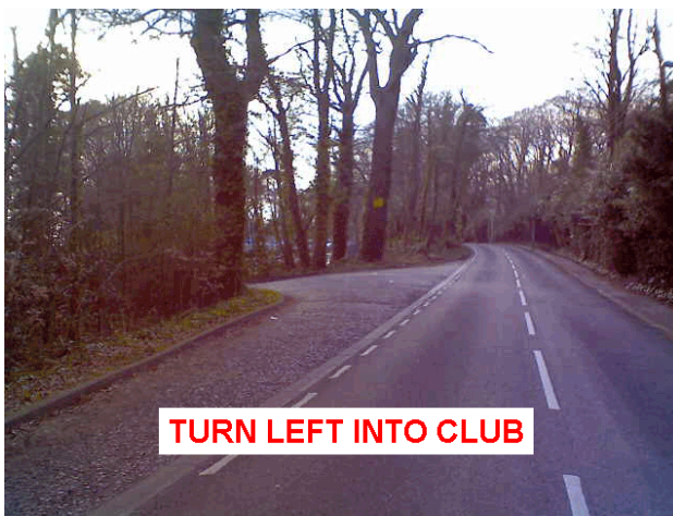
View of entrance to the club.

On occasion Weston has known up to 250 visiting boats to Open meetings and it is important that everyone follows the correct procedure when they arrive.