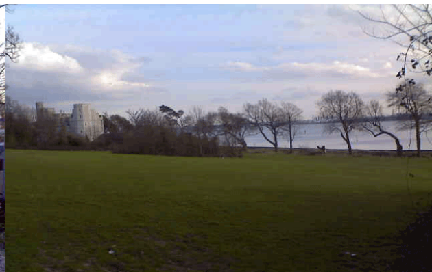
Visitor camping and rigging field

The visitor's field is hired out during open meetings for the specific purpose of accommodating our visitors for dinghy storage, car parking and camping. The first 30 visitors are free, but thereafter a charge of £1.50 per boat. Parking and camping shall be at the owner own risk.